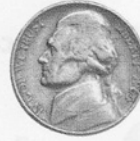
a nickel $.05