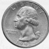
a quarter $.25