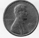
a penny $.01