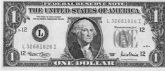
a dollar bill $1.00